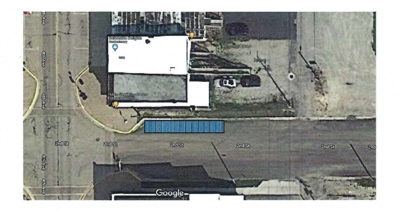
EXHIBIT A PROPERTY AND ENCROACHMENT